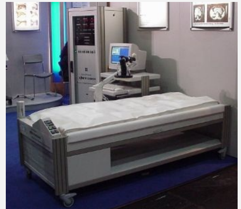
OncoTherm EHY 2000 System - Combines Hyperthermia with Rife

This unit is fully certified (medical CE) for use in Europe and already is being used in a number of hospitals and clinics.